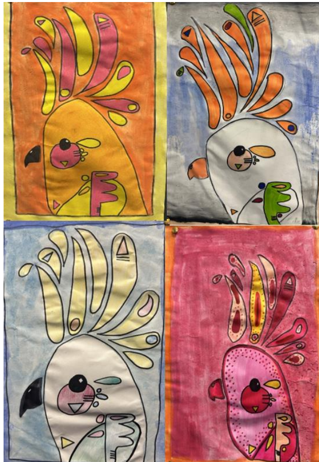
Pete Cromer Bird Artwork By 5/6H

Like our Facebook Page - Empire Bay Public School P&C to keep up to date with all things P&C and Canteen