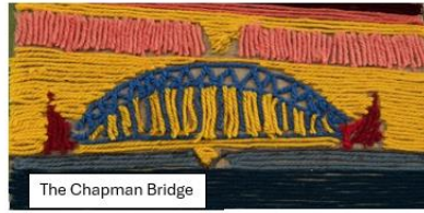
The Chapman Bridge