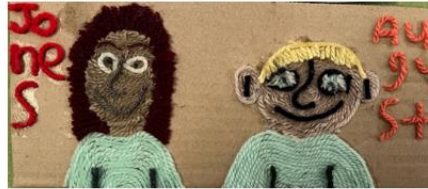
Friendship, Love, Understanding, Communication, Unity and Differences