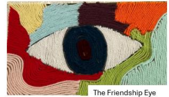
The Friendship Eye