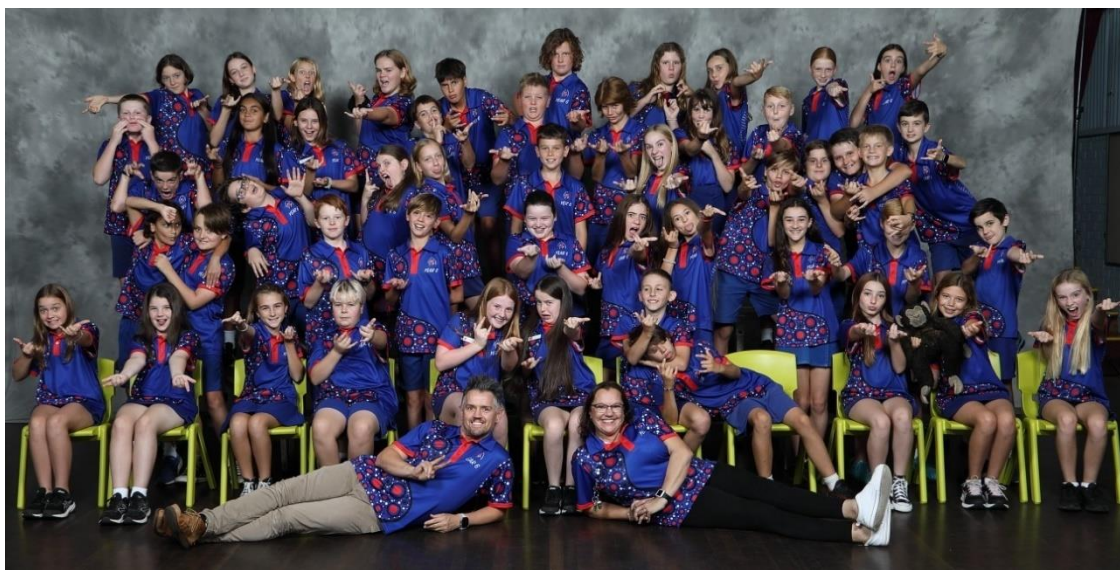
CLASS of 2023

We wish you all the best for your future schooling and life endeavours.